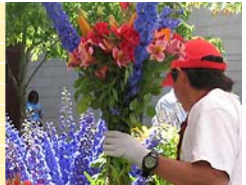
City Hall Farmers Market, Seattle, WA